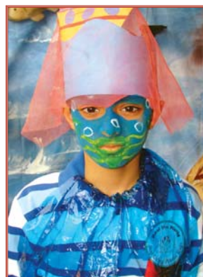
Symbolic face painting at the Nature Carnival

Thousands of people, including school children, thronged to WWF - Pakistan's Annual Nature Carnival in Karachi on Sunday 15th February, 2009. The Carnival proved to be a colourful event to educate and sensitize the masses, especially school children, on environment as well as on the importance of natural resources, through a healthy mix of informative and entertaining activities. WWF - Pakistan's Indus for All Programme and the Ministry of Environment