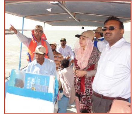
The Member of WWF - Pakistan taking boatride survey at Keti-Bunder