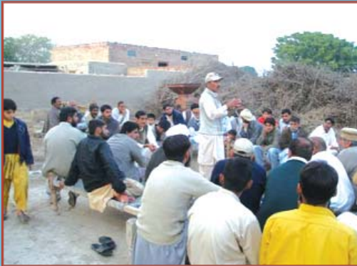
Outreach Programme in session

WWF - Pakistan started the Farmers Gathering/Outreach Programme, in different cotton cultivated villages in T.T.Singh, for the dissemination of BMP message under its project PSCI (Pakistan Sustainable Cotton Initiative). To accomplish the BMP dissemination message, the farmer gatherings are arranged in different villages. The main aim of these farmer gatherings is the introduction of WWF - Pakistan and BMPs of Cotton, introduction of FFS approach in newly selected villages and OVOF approach in the already selected villages by the technical team. The current problems and issues of the farmers are also discussed in these gatherings. At the end of the session, open discussions containing questions and answers started among the farmers and project team members. The project team has conducted 50 farmer gatherings in different villages of T.T.Singh.