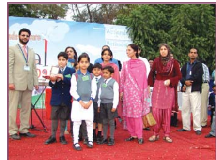
Prize distribution among school children