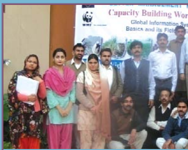
GIS staff at Botanical Garden Conference

Botanical Garden Conference was held at GC University Lahore on 2nd to 4th February 2009, to strengthen Public/Private/NGO Partnership for plant conservation activities. WWF - Pakistan presented two case studies in the conference titled as "Botanic Garden: A vehicle." The case studies represented the GIS work done under Indus for All Programme which included "Remote Sensing Based Forest Change Trend Analysis - A Case Study of Mangrove Forest of Keti Bunder, Indus Delta" and the second case study was titled as "Identifying Temporal Change Through High Resolution Satellite Images - An Example of Pai Forest Irrigated Plantation".