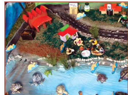
A Project displaying the effects of Climatic change on marine life